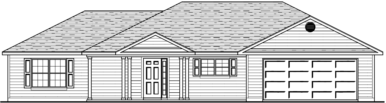
THE "HACIENDA" MODEL